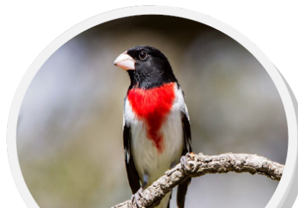
Rose Breasted Grosbeak