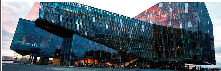
The Harpa Concert Hall and Conference Center in Reykjavik. Glass façade's play of light represents the idea of a glacier. Designer Olafur Eliasson