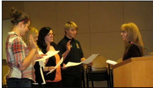
County Board Swearing-in ceremony

Local government officials want to know what our youth think! Often times, teens are able to see issues and opportunities adult leaders miss.