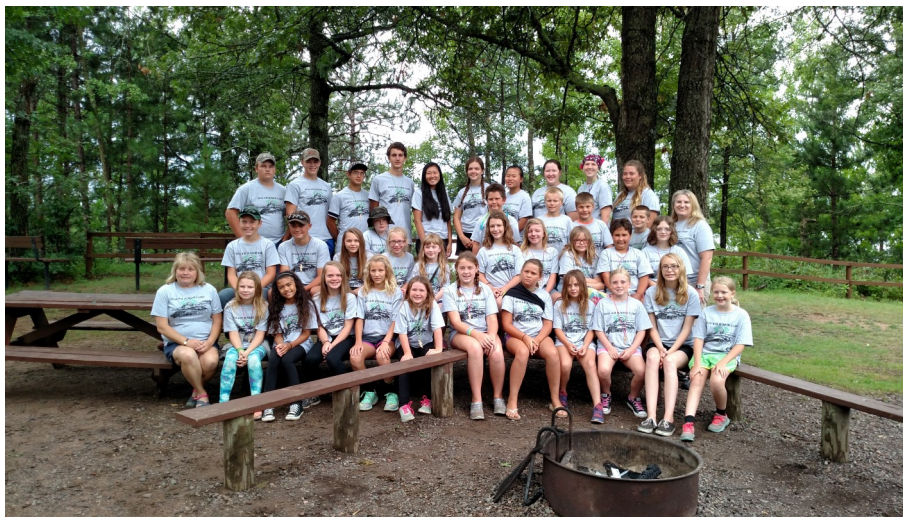
Olympus Junior Camp 2016 was a hit! Thanks to all the families who let their kids come, the counselors who did a great job leading, and the adults who helped! See you next year!