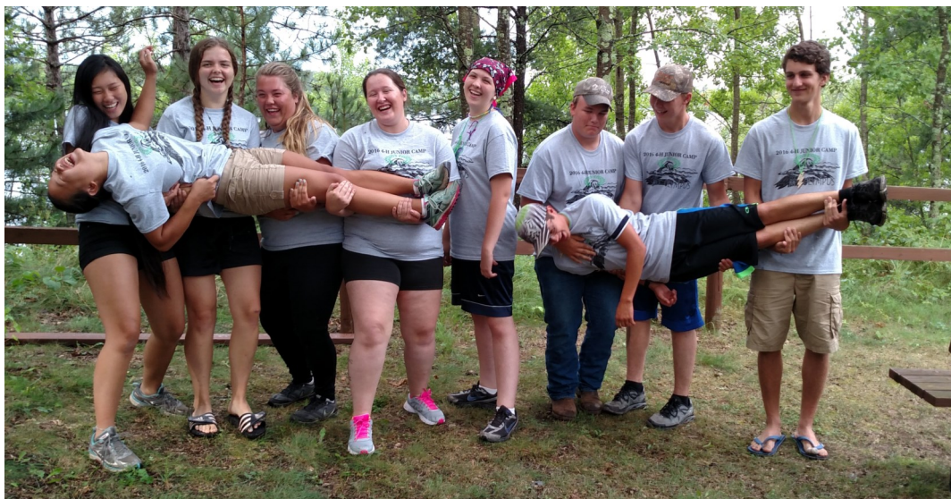
Unofficial camp counselor photo