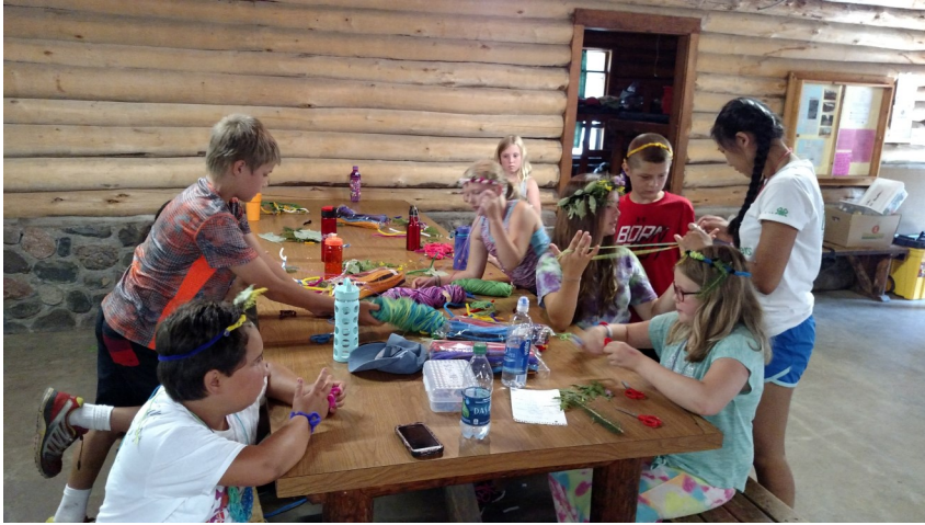
Photo on left: Campers are making wreaths to go with our Mt. Olympus theme and also learning to finger knit.