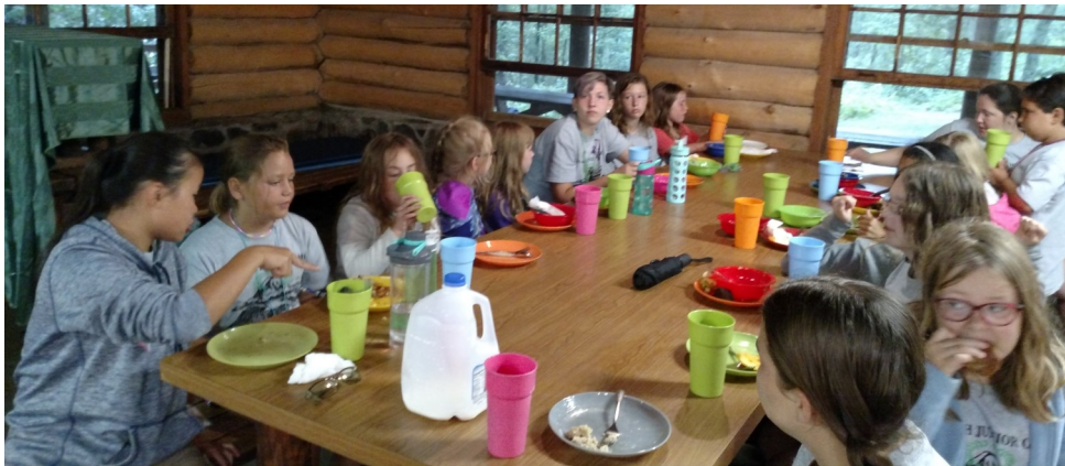
They still weren't awake after breakfast!