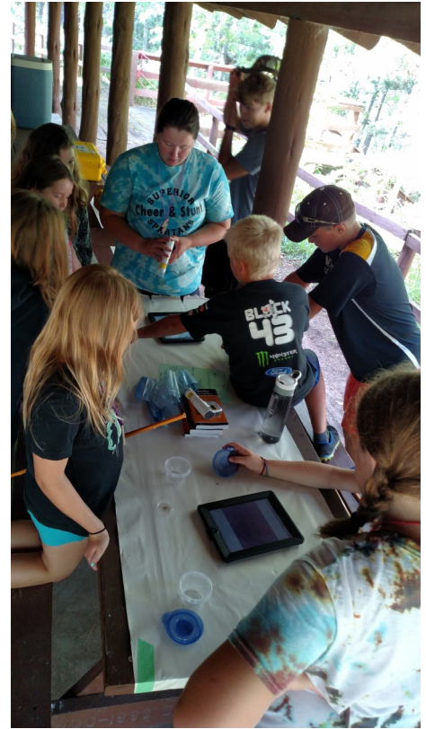
Above: Jr. Campers using a digital microscope to look at bugs they caught!