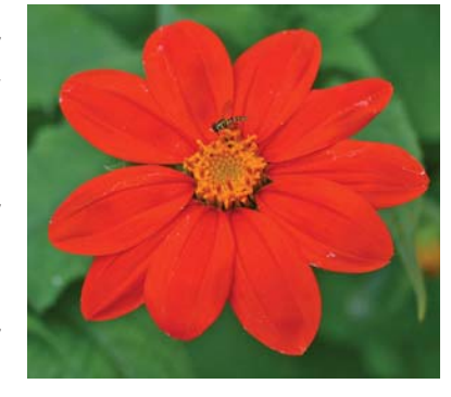
Many plants in the aster family have beneficial-friendly flowers.