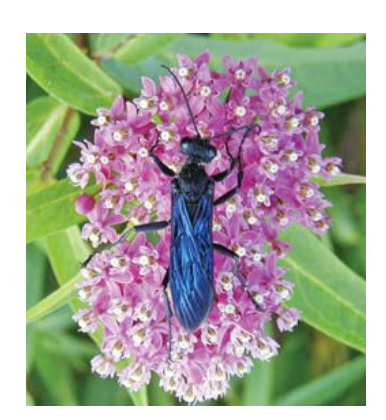
Flower architecture affects insect visitors.

Fagopyrum sagittatum Potentilla spp. Asclepias spp. Phacelia spp.