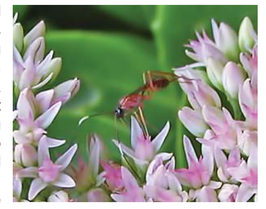
Pollen and nectar need to be available throughout the growing season for different natural enemies.

Equally important as flower size and shape is when pollen and nectar are produced by the flowers. Many natural enemy species are around as adults only for short periods during the growing season, so to be useful, pollen and nectar must be available when the adults are active. This is most easily achieved by planting a mixture of plants that have relatively long blooming periods that overlap in time. Perennial plants often have shorter blooming periods than annuals, so particular attention should be given to plant diversity and blooming times in perennial borders designed as habitat for natural enemies. In the home garden, sequential plantings of dill, coriander, and caraway can be made to provide a continuous source of their valuable flowers throughout the season.