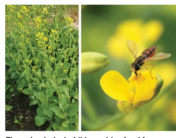
Flowering bok choi (L) provides food for a small syrphid fly (R).

The Brassicaceae, or mustard family includes many common crops such as radish, mustard, arugula, broccoli, and bok choi that