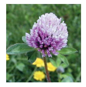
A clover flower.