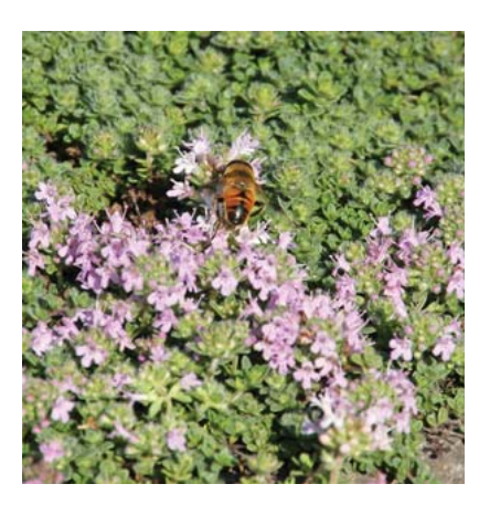
A syrphid fly visits creeping thyme flowers.