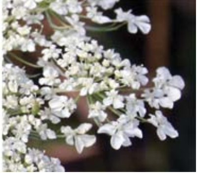
The "flower" of Queen Anne's lace (L) is made up of many small flowers (R).