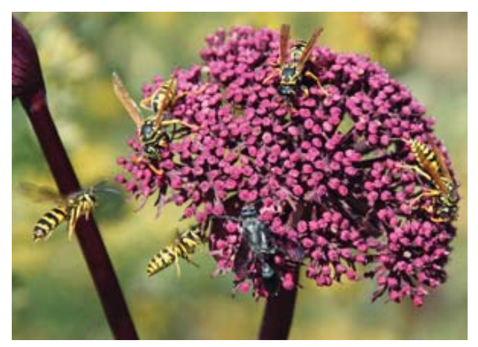
Many natural enemies visit flowers for the nectar and pollen.

Many natural enemy adults – particularly tiny wasps and flies – visit flowering plants to obtain nectar and pollen. By providing nectar and pollen, flowers can attract and keep the natural enemies of many pests in the home landscape, enhancing natural or biological control. Some of the many beneficial insects that visit flowers include lady beetles, green lacewings,