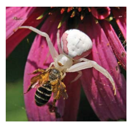
Not all flower visitors are there for the nectar!

syrphid flies, tachinid flies, sphecid wasps and various parasitic wasps. Predatory bugs (such as nabid bugs, minute pirate bugs or twospotted stink bugs) and spiders can also be